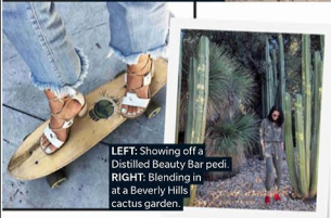
LEFT: Showing off a Distilled Beauty Bar pedi RIGHT: Blending in at a Beverly Hills cactus garden.