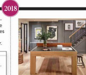
The April issue showcases Nam's makeover of her own basement, complete with custom Ping-Pong table and plenty of smart budget ideas.