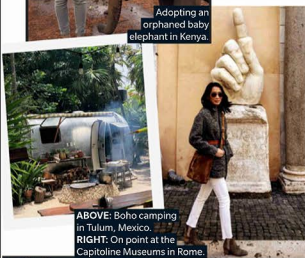
ABOVE: Boho camping in Tulum, Mexico RIGHT: On point at the Capitoline Museums in Rome.