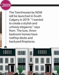
2019 The Townhouses by NDM will be launched in South Calgary in 2019. "I wanted to create a stylish and unfussy elegance," says Nam. The lush, three-bedroom homes have rooftop decks and backyard fireplaces.