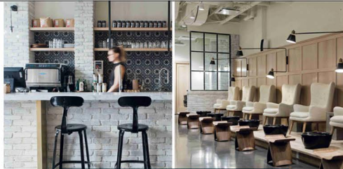
Illustration courtesy of Nam Dang-Mitchell (2011, 2012, 2016, 2017, 2018) / Illustration courtesy of Nam Dang-Mitchell (2011, 2012, 2016, 2017, 2018) / Illustration courtesy of Nam Dang-Mitchell (2011, 2012, 2016, 2017, 2018)