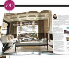
Nam's living room is highlighted in October's "Design Lesson."