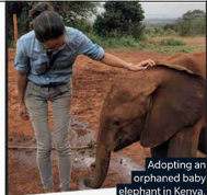
Adopting an orphaned baby elephant in Kenya